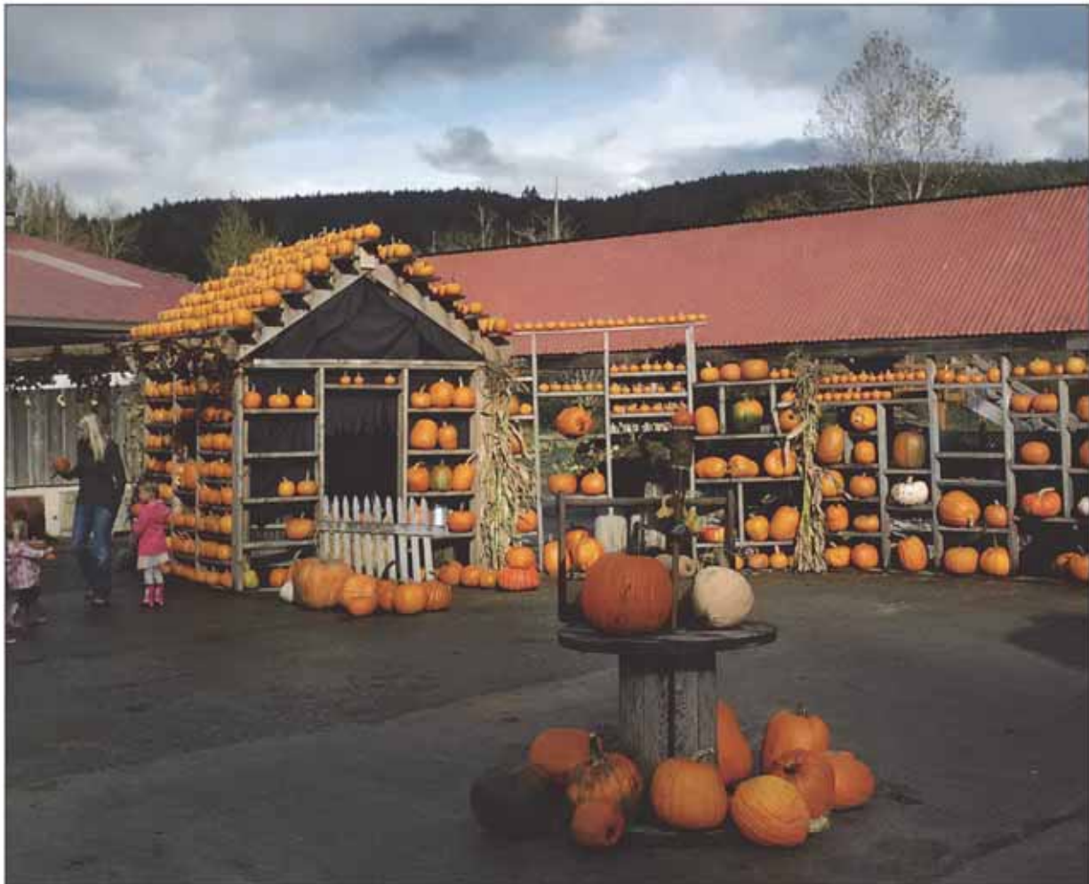
Pumpkin Nostalgia! October 2012 at Fall City Farms