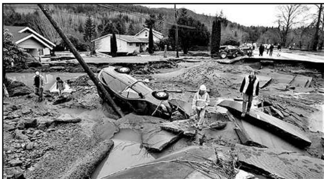
Below and Right: 2009 Snoqualmie River flooding down Route 202 between Snoqualmie and Fall City