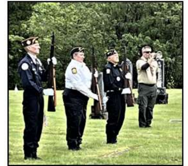
Memorial Day Ceremony 2022

All are welcome to join in remembering and honoring our fallen veterans, with local Boy Scouts Color Guard, military representation, and a speaker.