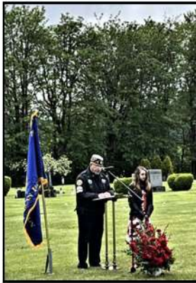
Memorial Day Ceremony 2022

The American Legion Renton-Pickering Post 79 of Snoqualmie will be conducting some activities around the Valley this upcoming Memorial Day, including a Memorial Day ceremony at the Fall City Cemetery.