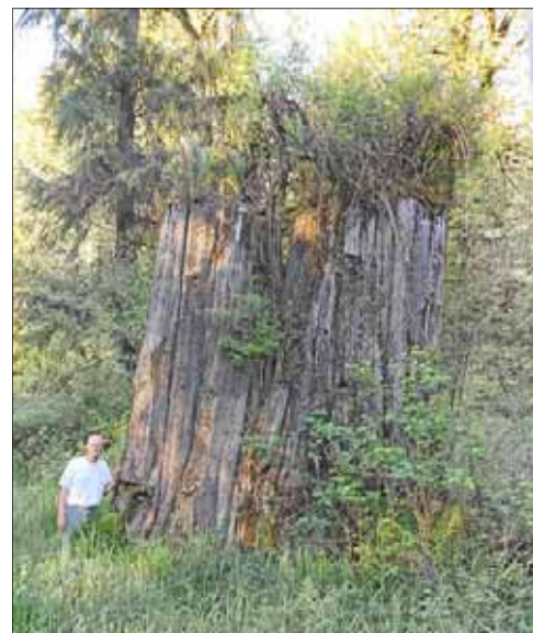
Stump with Glen (6-ft tall) for scale

I would like to nominate the Fall City tree shown in this photo for an upcoming Fall City Neighbors newsletter feature. Well, okay, it was once a standing old growth cedar probably until it was logged about 100 years ago +/- . The old springboard cuts are still very visible around its base from when it was cut in the old days. But it is now a grand old stump and a reminder of the gigantic trees that once stood everywhere in and around Fall City. Everybody who enters Fall City coming from Preston on the Preston-Fall City Road can't miss it on the right side of the road. It stands about 10-12 feet high and looks quite sound even after 100 or more years - classic old growth cedar. It is located about a quarter of a mile south of 328th way SE where the green bridge crosses to the left over the Raging River. This grand old double stump remnant cedar has seen people pass by for more than a century, is my guess. I am assuming that the Preston-Fall City Road was once a trail long before it became a road and then eventually got paved. I look at it every time I drive by, which has been for the 29 years I have now lived in Fall City. If it could only talk.