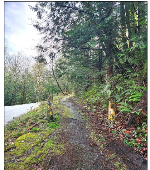
Old paved road, now a trail