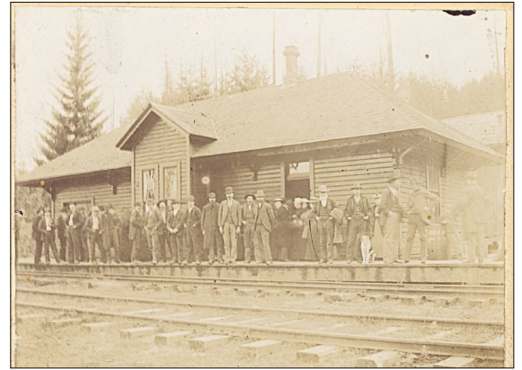
Waiting for the train excursion at the depot located on the road to Lake Alice. Dated 1890

It started with the railroad. In 1889, the Seattle, Lakeshore and Eastern Railroad tracks passed near Fall City, and a depot was constructed at the current site of the Preston-Snoqualmie Trail parking lot on Lake Alice Rd. In 1889, Doc Taylor petitioned King County to have a road built to improve access to the depot. No maps of this road are available, but it is recorded as County Road #234. The original entrance to what is now Lake Alice Rd was behind the cemetery, along with the later-built David Powell Rd. In 1964, the County approved plans for the Lake Alice Road Connection, moving the entrance further down Preston-Fall City Rd, and creating what is now SE 47th St. The old portion of the paved road behind the cemetery now serves as a trail for walking and biking from David Powell Rd.