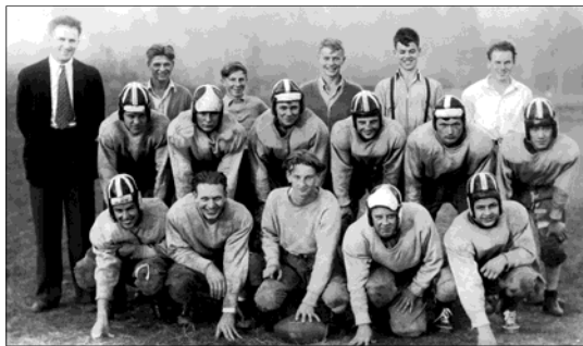
Football team, 1936-37