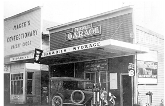
Lud Peterson’s first Model Garage, 1924

When rationing of gas and tires began with WWII, and later the construction of Interstate 90, the auto tourist industry all but left Fall City.