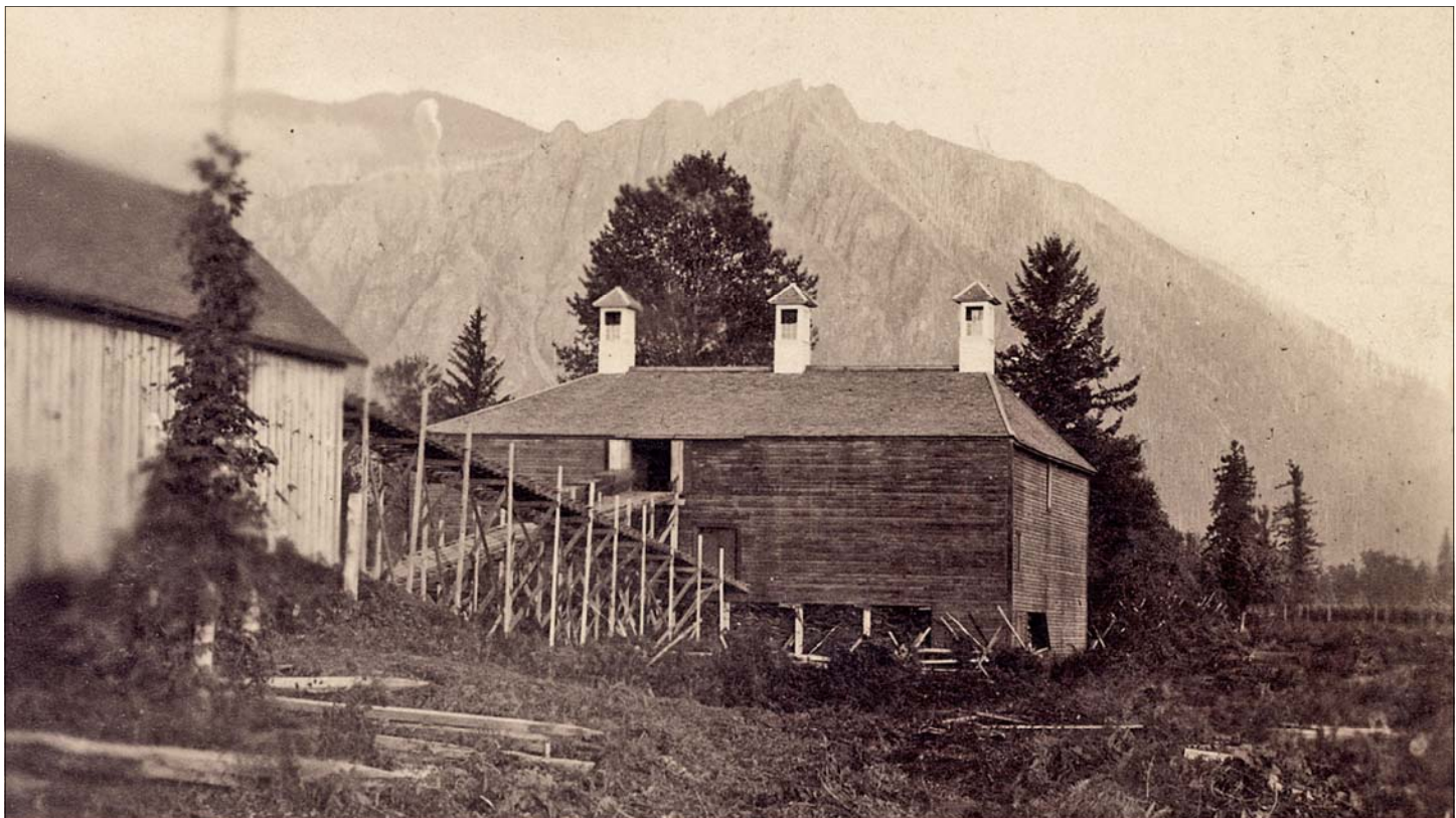
Snoqualmie Hop Ranch 1889