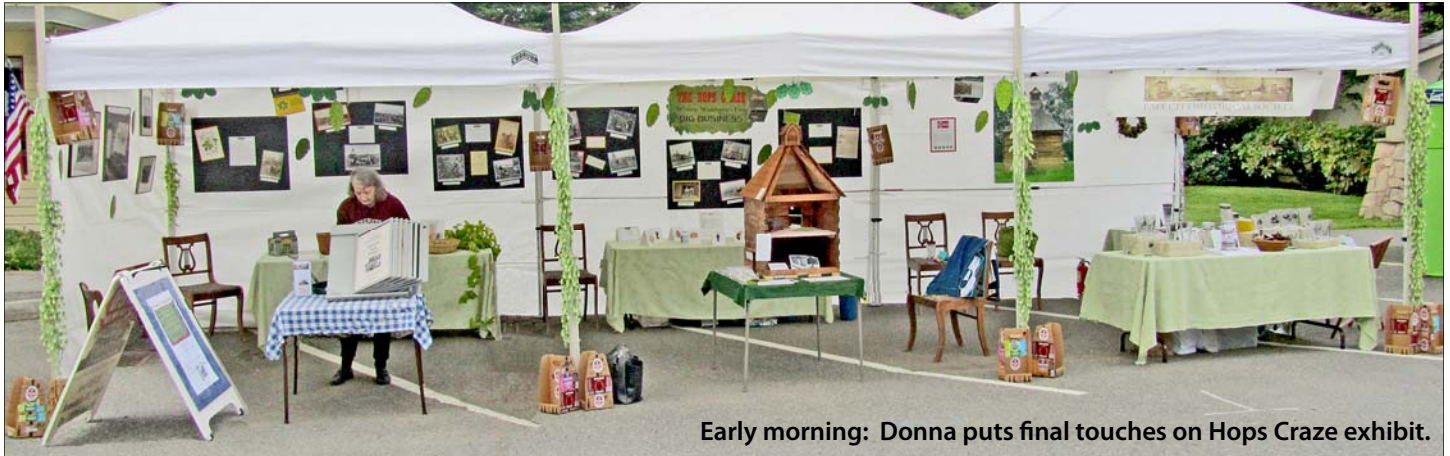
Early morning: Donna puts final touches on Hops Craze exhibit.