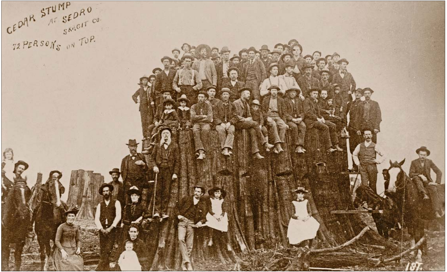
Museum of History and Industry, Seattle