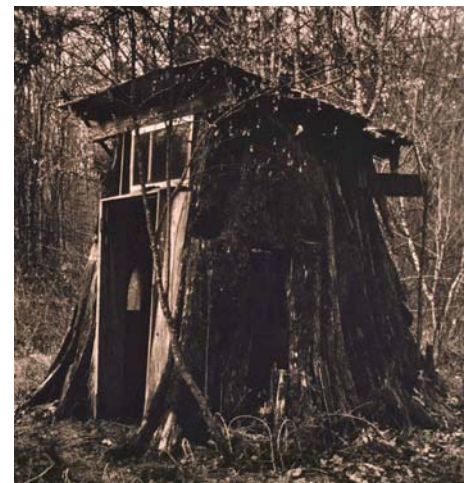
Stump House, Snoqualmie 1992 Mary Peck, King Co Public Art Collection