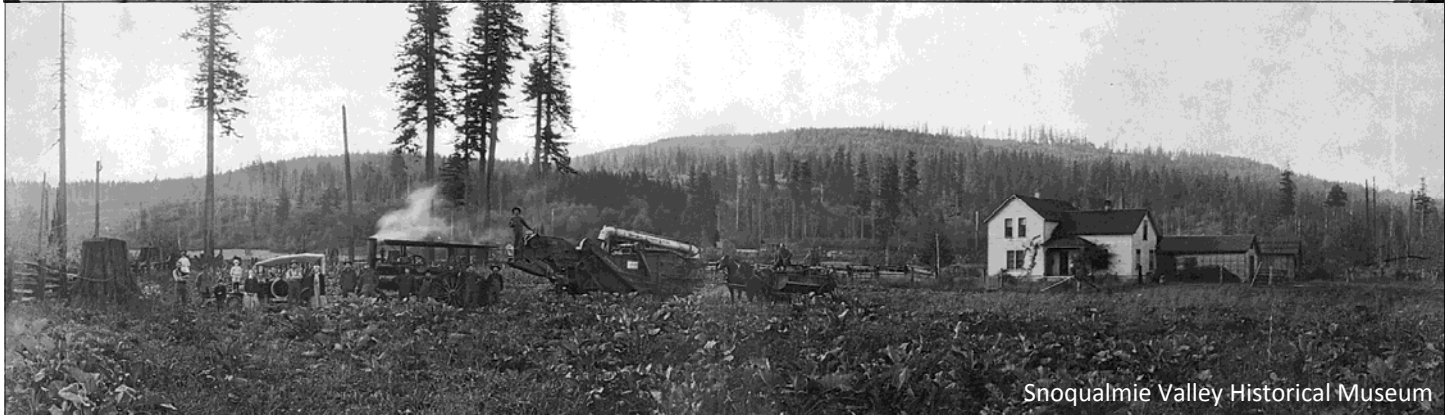
Snoqualmie Valley Historical Museum

Support for our work from King County Heritage 4Culture is gratefully acknowledged.