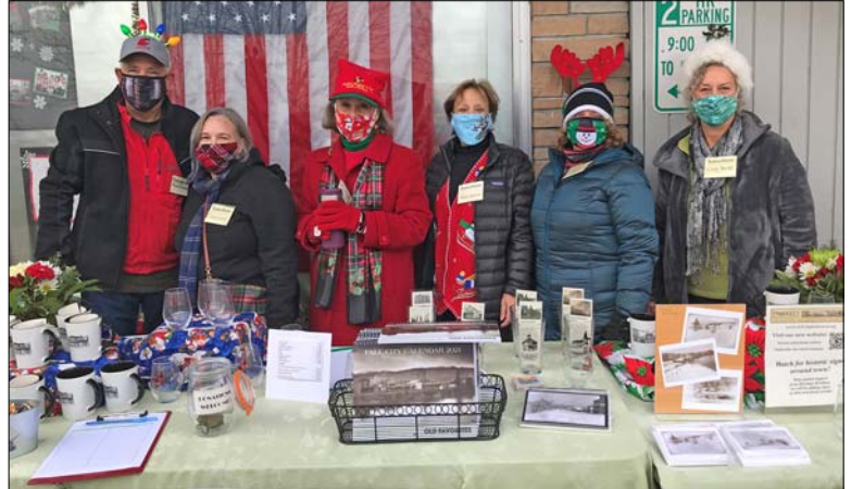
Board members staff the Store, on a cold but sunny day!

After their purchase of the building at 33719 SE Fall City-Redmond Road, the Traversos were kind enough to allow us to place displays in the windows through Christmas. It was fun to have “the pioneers” out on River Street! They also gave us permission to set up on the sidewalk for our Dec.12th Holiday Pop Up Store in front of the building. Thanks to all of you who came by to make it a very successful day!