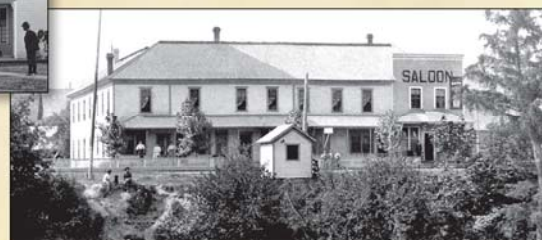
Semipalmist Valley Historical Museum